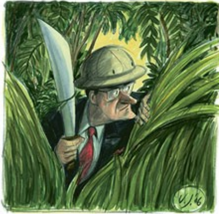
Victor Juhasz for Barron's

was a place where the adventurous could hit gold if they weren't scalped first. Global "frontier" stock markets offer similar opportunities and risks for the modern investor.